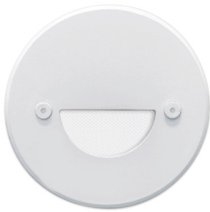
Half Round Wall Recessed Night Light