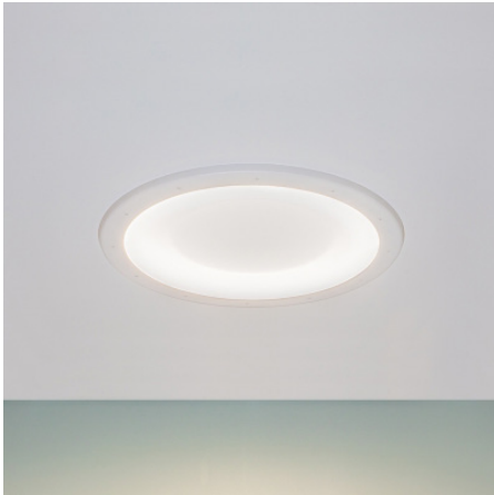
Symmetry Circular Light