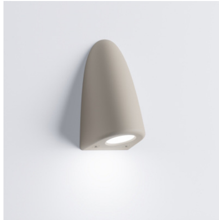
Gig Wall Mounted Light