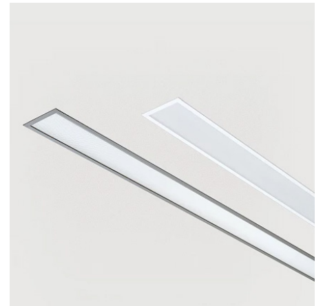
Matric F5 Tuneable White Linear Extrusion